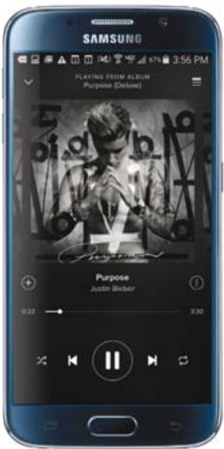
SAMSUNG Galaxy S6