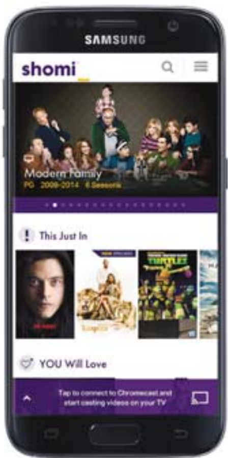
SAMSUNG Galaxy S7