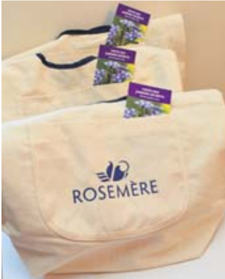
Gift sacs like these with the Town of Rosemère's logo on them were given to new residents who were greeted by the mayor and council last week.