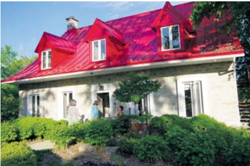
Rosemère's Maison Hamilton is one of the town's most cherished cultural and heritage institutions.

"More than 200 new families came to live in Rosemère over the past year"