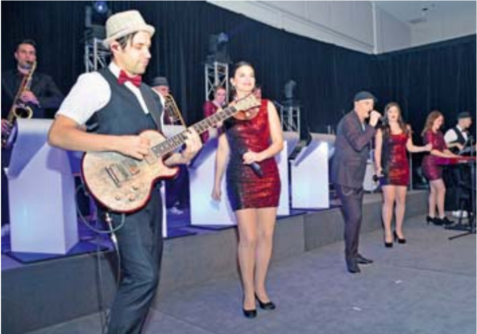
The Backbeat Showband provided a steady stream of music that kept gala attendees busy on the dance floor.