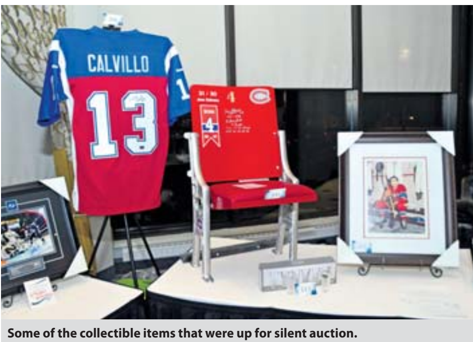
Some of the collectible items that were up for silent auction.

"The future of our students and children, their education, really depends on more and more people sharing our vision for growth and making a difference," she continued. "For that to happen we must continue to be involved. I'm confident that our future is bright. If we listen closely for the heartbeat, maybe it's your own, your child's, your student's, the one that gives a voice to our vision of successful education."