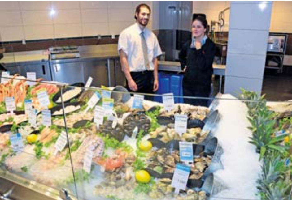
IGA Extra Sainte-Thérèse's completely renewed fish and seafood department features oysters year-around.