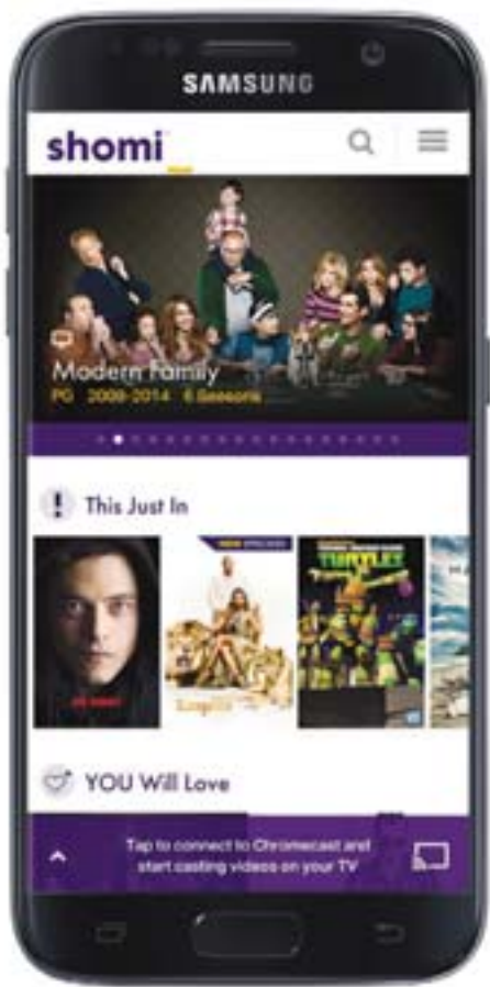
SAMSUNG Galaxy S7