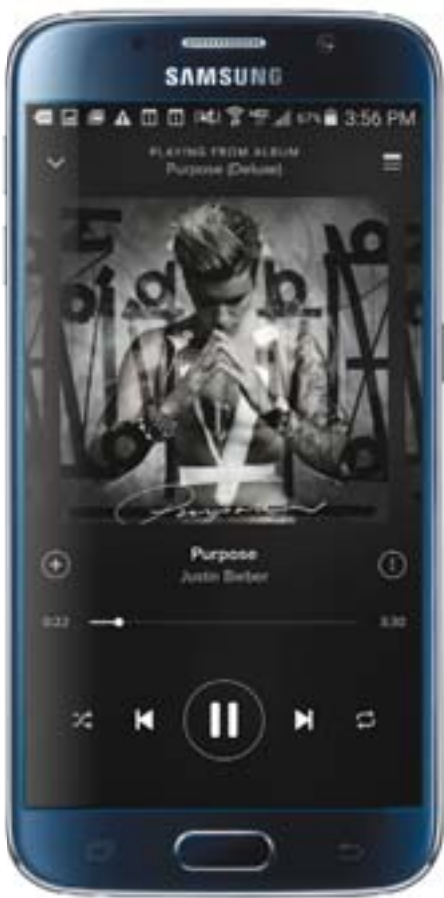
SAMSUNG Galaxy S6