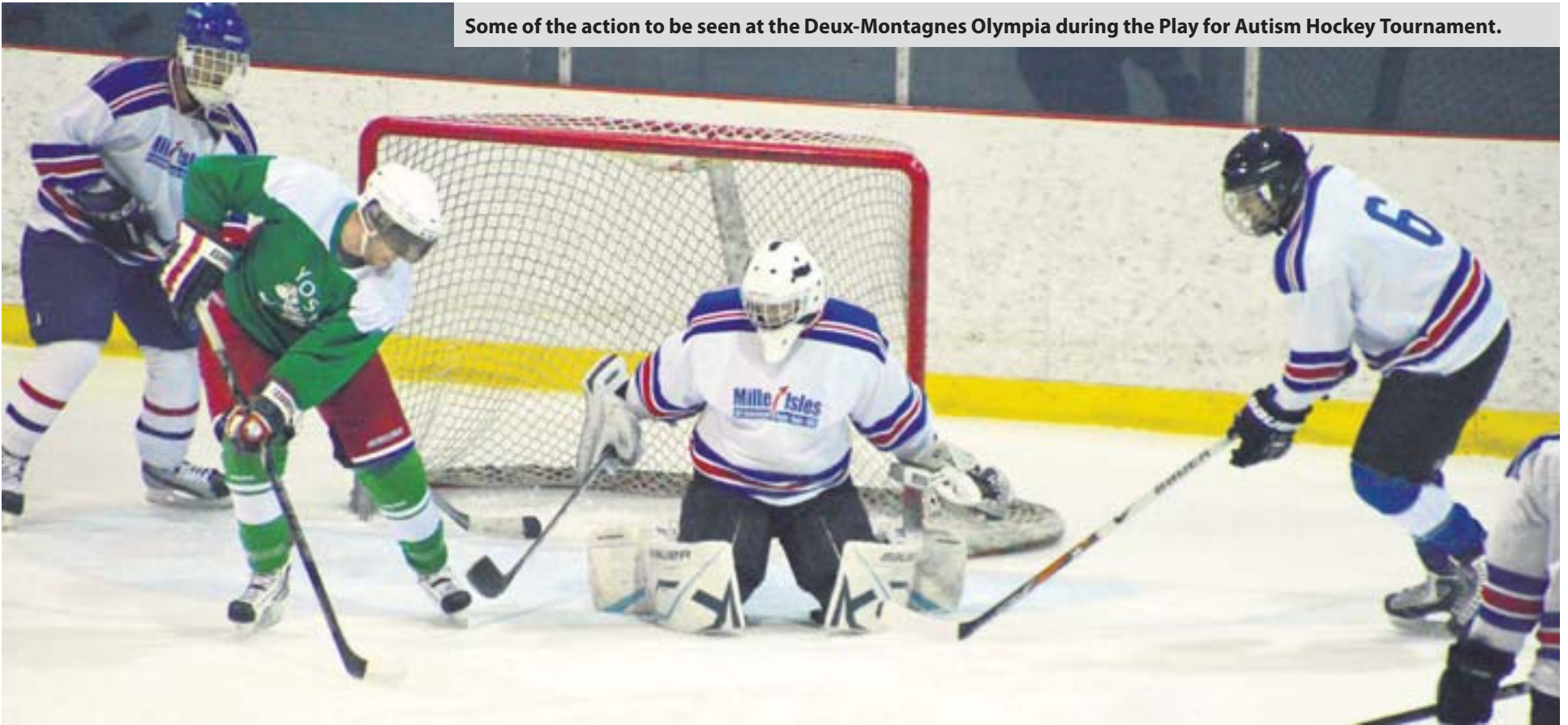
Some of the action to be seen at the Deux-Montagnes Olympia during the Play for Autism Hockey Tournament.