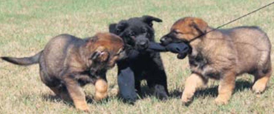
Above photo: Jake, Jolt and Jinx were born at the Centre on March 4, 2016.

RCMP police service dog teams are a vital part of front line policing. They search for missing or lost people, track and apprehend criminals, remove illicit drugs from the streets, detect explosives and search for and recover evidence used in crimes. ■