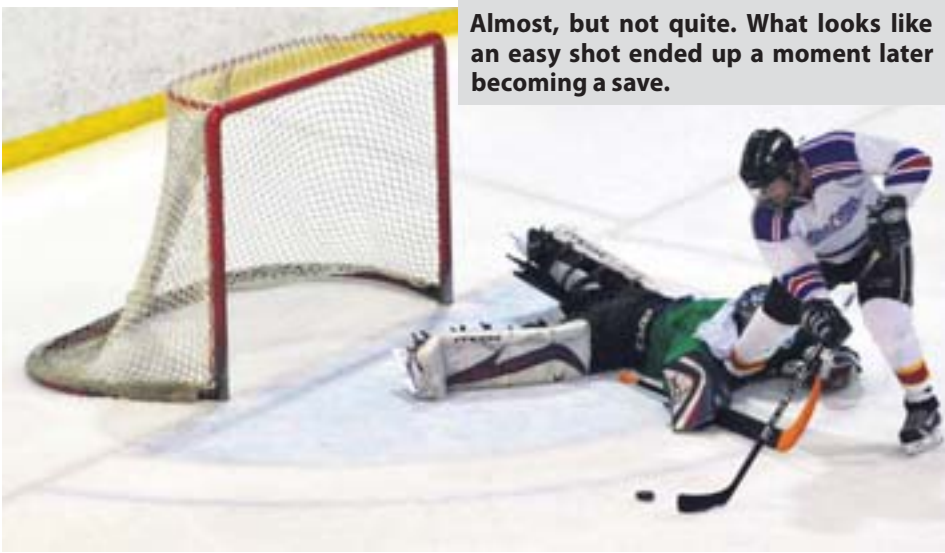
Almost, but not quite. What looks like an easy shot ended up a moment later becoming a save.