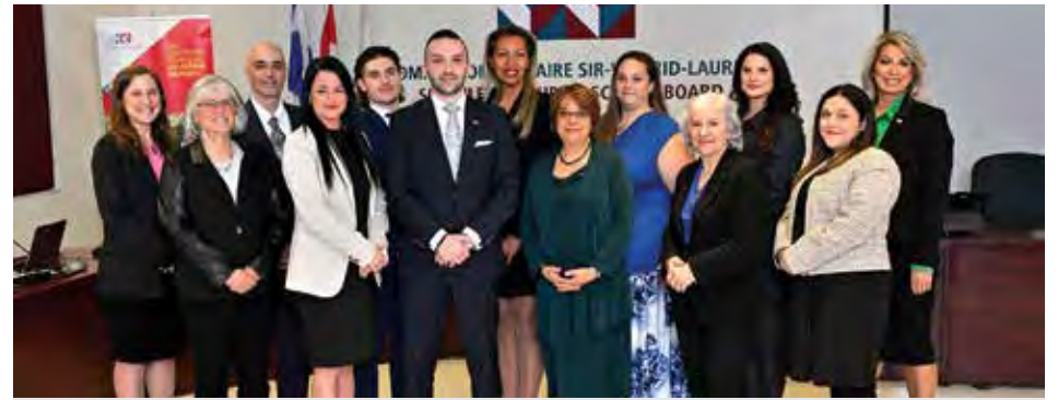
The Council of Commissioners ready to meet the new challenges.

Regarding his take on some immediate needs that must be addressed, Di Sano outlined a road