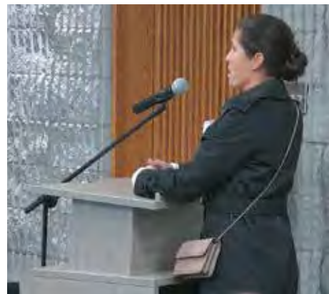
A frustrated resident voices her displeasure with the council as she deals with the city's constant refusal of approving one of her housing projects.

City Council has previously upheld zoning preferences in areas like these, favoring single-family homes on larger lots, though the resident argued that demand for smaller housing units is present. Despite her consultation with professionals who confirmed her rights to pursue the project, the council remained firm on its stance for this property.